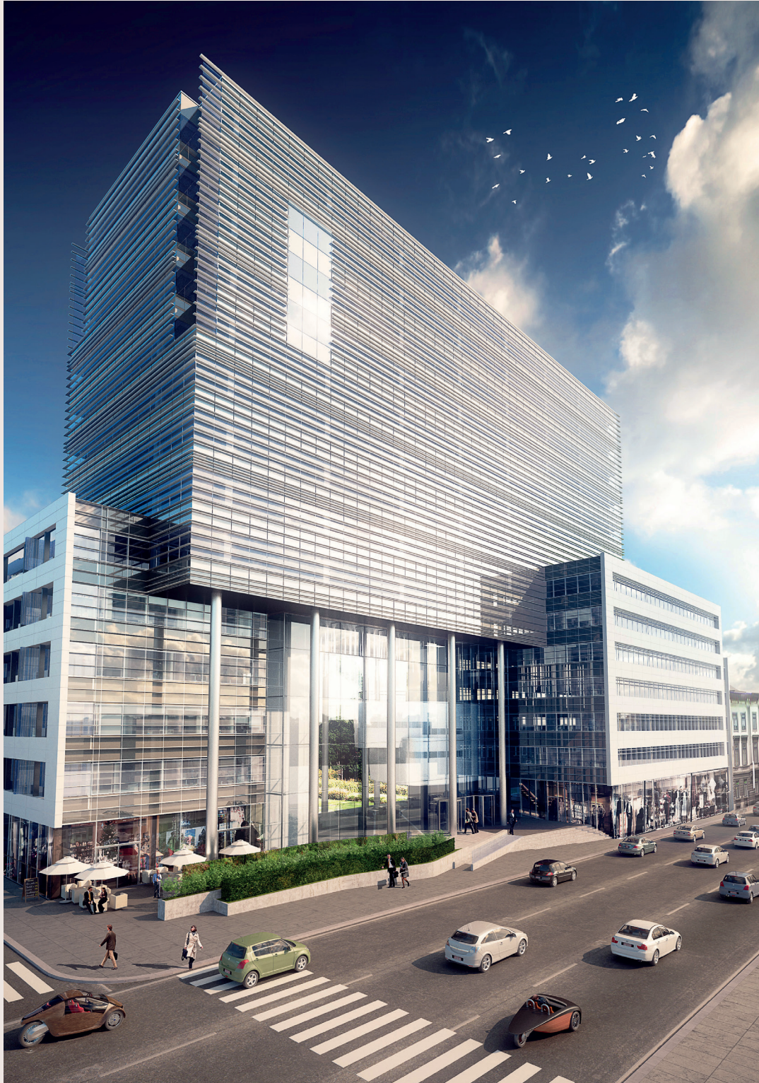
As of January 1st 2018, CEPA has a new office at the hearth of the EU Institutions.