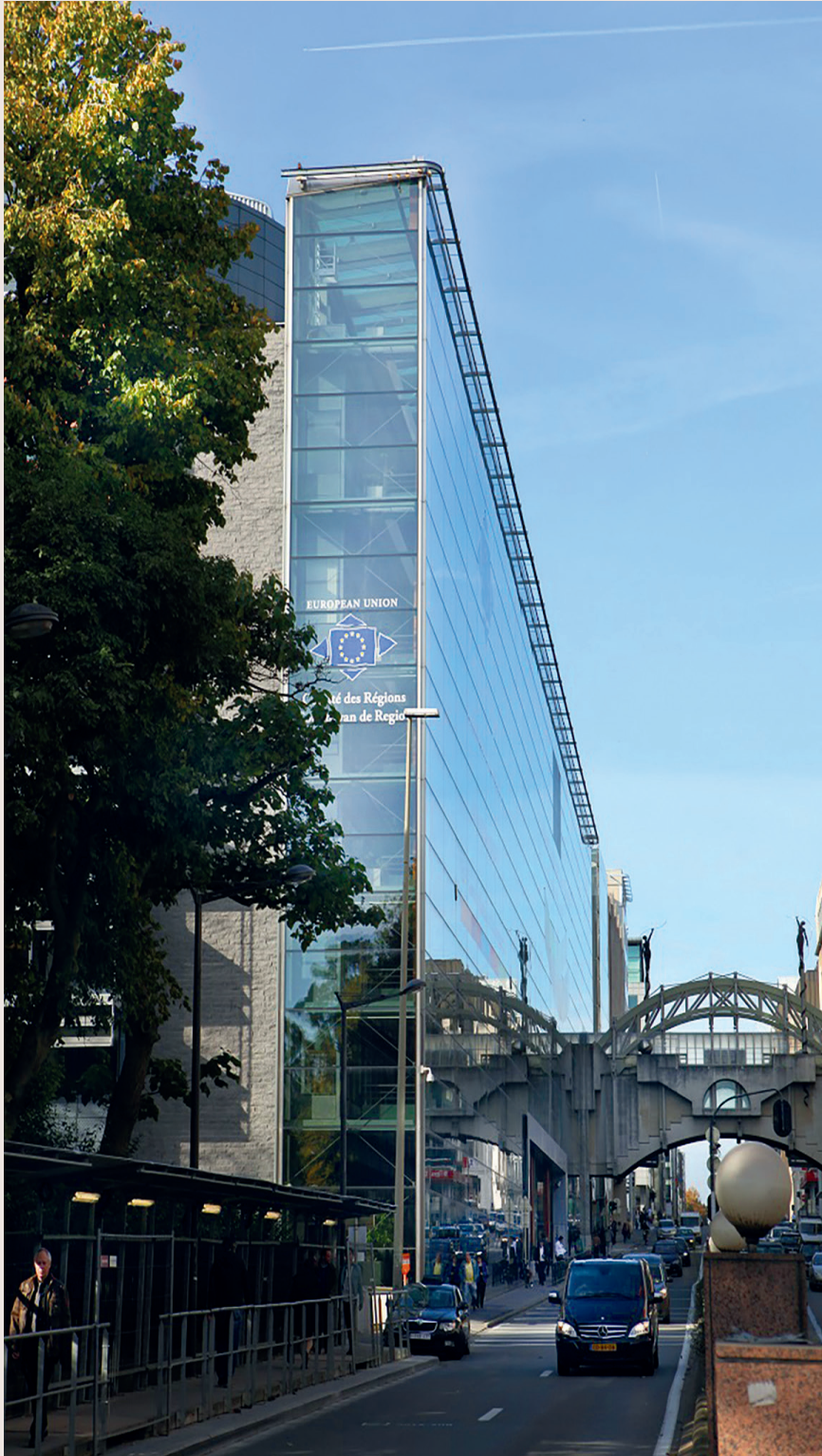
Building of The European Committee of the Regions in Brussels.